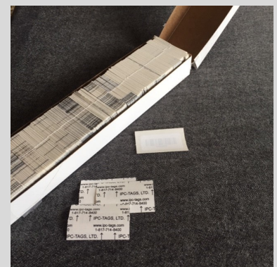
Labels are supplied in boxes of 1000 labels.

Pricing: In-Stock $0.21/label 1,000 - 20,000 $0.19/label 20,000 - 50,000 call for quote over 50,000 Custom $0.25/label 2,000 - 50,000 call for quote over 50,000